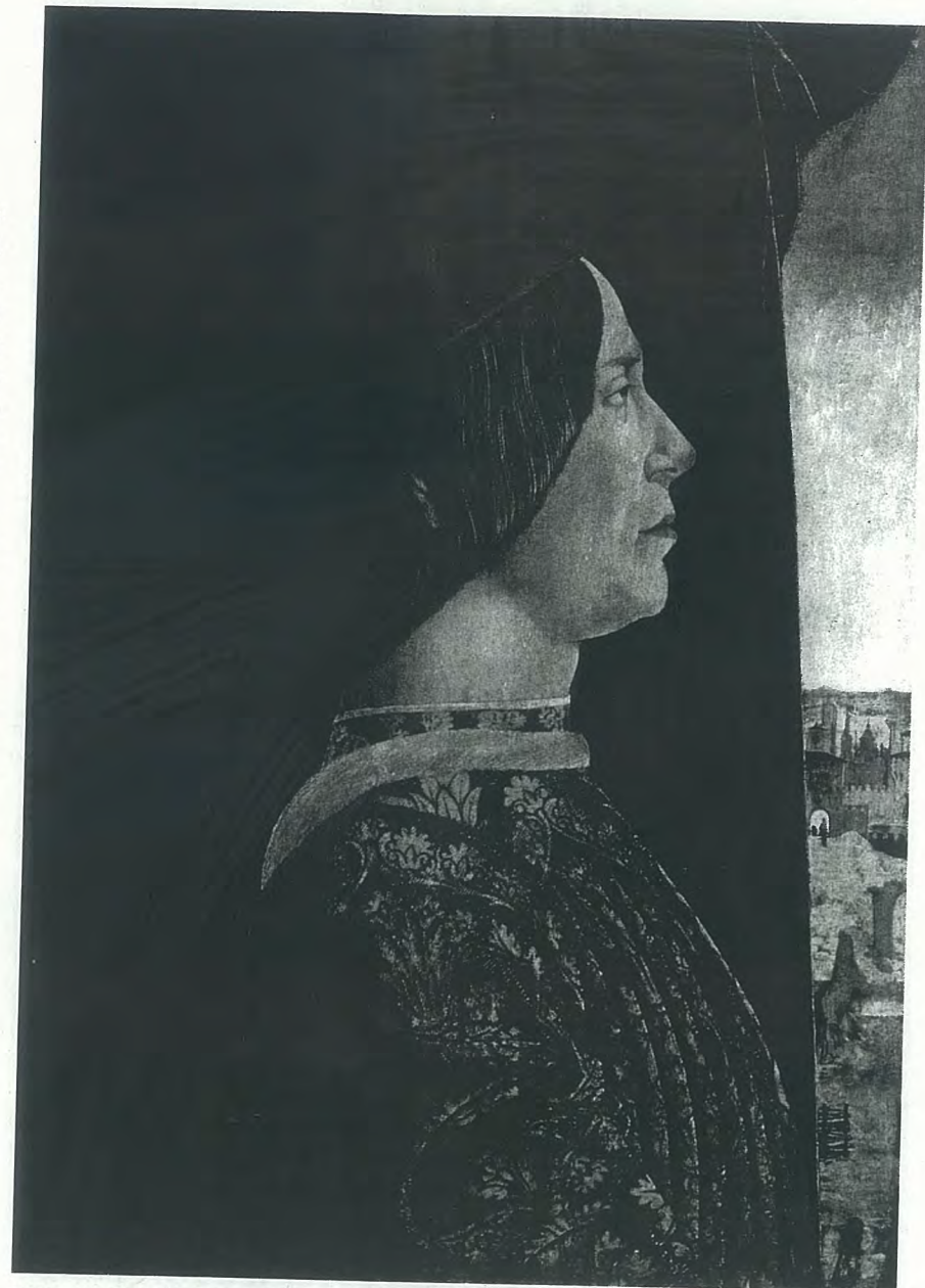
Painted by Ercole de' Roberti c. 1475, these companion portraits depict Giovanni II Bentivoglio, ruler of Bologna from 1462 to 1506, and his wife, Ginevra Sforza Bentivoglio.

In fact, Bembo and Ginevra's love affair probably existed only on a symbolic level. Under the influence of the Medici dynasty, presided over by Cosimo and later by his grandson Lorenzo the Magnificent, upper-class Florentines practiced an intricate and