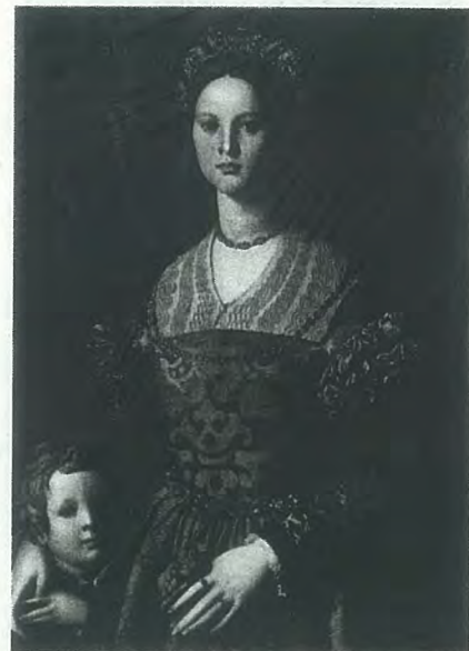
By the early 16th century, the style for female portraiture had evolved to include the frontal view, used here in Agnolo Bronzino's c. 1540 A Young Woman and Her Son .

Brown has taken great pains to reproduce the effect of the original design. The exhibition includes a Leo-