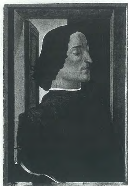
Botticelli's idealized, golden beauty (left) is thought to represent Simonetta Vespucci, the platonic love of Giuliano de' Medici, also memorialized (above) by Botticelli.

tile ground for creative innovation. Florentines devoted themselves to a thriving international economy and to the world of ideas. Petrarch was part of a literary triumvirate, along with Dante and Boccaccio, that set a very high standard for Florentine intellectual life. It is estimated that by the 14th century as much as one-third of the male population was literate—an extraordinary rate during that time—and citizens were expected to participate actively in civic affairs. The urban bourgeoisie not only patronized the arts but also practiced them. Lorenzo de' Medici, one of the chief connoisseurs of the arts in all of Italy, wrote lyric poetry and treatises alongside Ficino and other scholars. By the 15th century, Florence's primacy as the center of creative and intellectual activity throughout Southern Europe was well established.