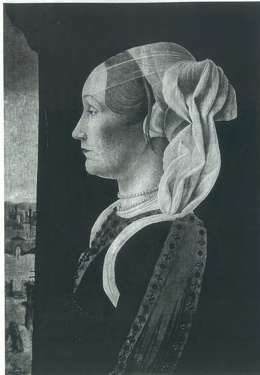
The curtained backdrops symbolize rulership and frame views of the pair's territories. Ginevra's decorative portrayal, pale skin and blonde hair denote her beauty and rank.