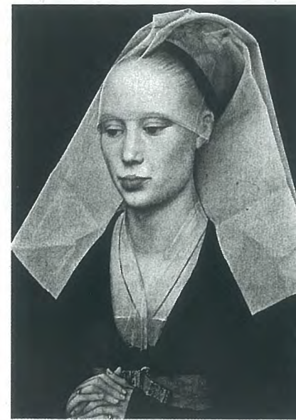
Works by Northern masters, such as Rogier van der Weyden's Portrait of a Lady , c. 1460, with its more intimate three-quarter pose, greatly influenced Renaissance portraiture.

The first step was prompted by a tacit challenge. Florentine painters began to consider how they could depict the inner beauty expressed so effusively by the literati. A paragone , or rivalry, developed between writers and painters as each aimed to immortalize Florentine women. Writers and scholars in the Medici circle doubted painting's ability to depict ideal beauty. They contended that only poetry could adequately describe the capacity of a woman's smile to transform the world. This attitude was subtly reinforced in Florentine society in the